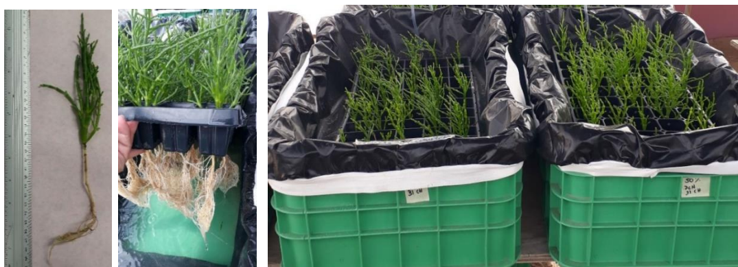
Figure 1. Salicornia bigelovii grown in hydroponic system with different salinity levels (0, 50 and 100%).

The trays with 45 seedlings each were placed in the plastic boxes described above, containing 35 L of seawater at different salinity levels (0, 50 and 100%, equivalent to N-0, N-50 and N-100), added with nutrient solution (45 seedlings per tray and 135 seedlings in total). A black semirigid liner-type plastic cover was installed, externally attached to the boxes to hold the trays and avoid the light incidence and growth of moss and filamentous algae, in the liquid medium, allowing direct contact of the roots with the nutrient solution (Figure 1) with the different saline treatments included in the experimental design (Figure 2). Permanent aeration was provided by a high efficiency blower, pressure 21 KPa, suction -16 KPa and a flow of 130 m 3 h -1 , 110 volts/220 single-phase (Ring Blower QM machine, RB-750).