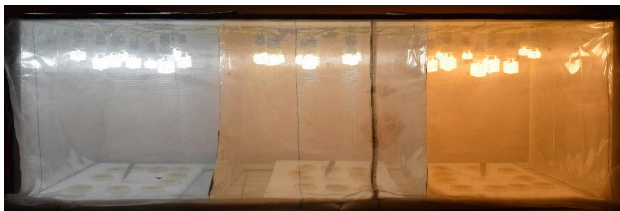
Figure 1. In vitro culture of Sclerotium rolsii in a growth chamber with fluorescent lamps of cold white (left), neutral (center) and warm (right) light.

The research was carried out in the Laboratory of Physiology and Plant Anatomy of the Faculty of Agronomy, Autonomous University of Sinaloa, in Culiacán, Sinaloa, Mexico, located at coordinates 24° 37' 29" north latitude and 107° 26' 36" longitude west, with an altitude of 38.5 meters above sea level. Growth chambers measuring 44 x 70 x 80 cm (length, width and height, respectively) were used, with walls of mesh woven with 16 x 16 crystalline monofilaments of high-density polyethylene per cm 2 , sides covered with high-reflectance Mylar paper and lighting system with compact fluorescent lamps, spiral type (FLE23HLX, General Electric, USA) with cold white (LBF: 6500 K), neutral (LBN: 4000 K) and warm (LBC: 2700 K) and with a photoperiod 12 h (Figure 1).