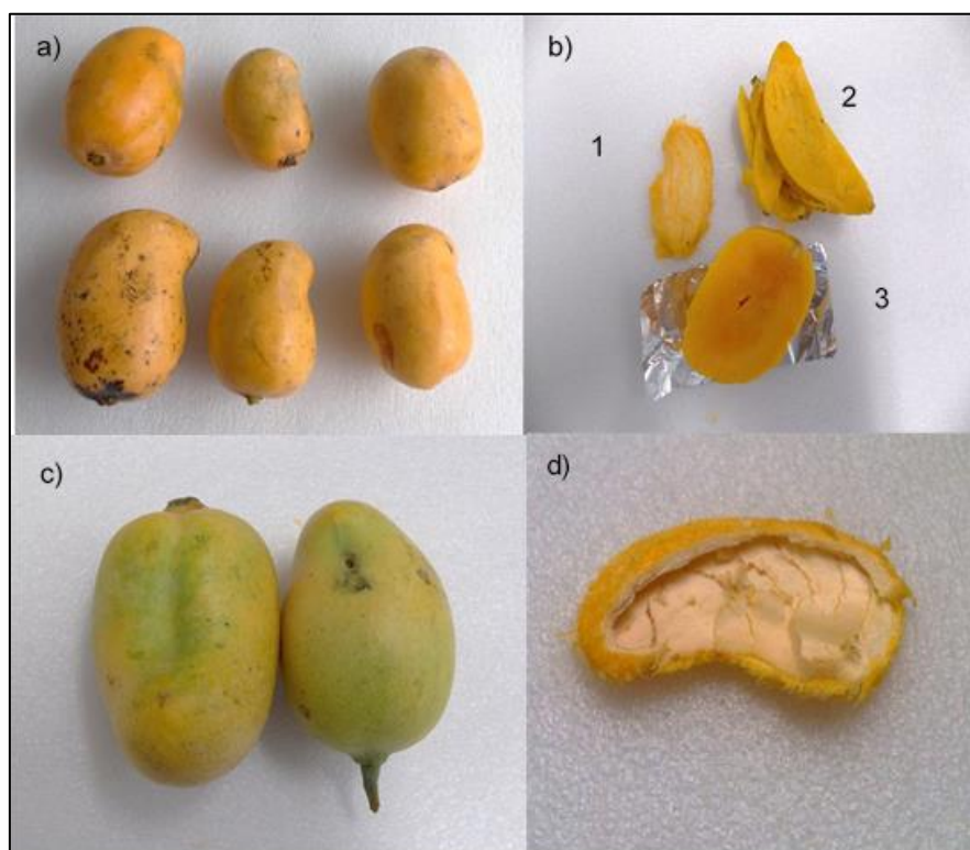
Figure 2. a) parthenocarpic fruits of mango cv. 'Ataulfo'; b) fractions of the fruits: 1 endocarp (seed); 2 exocarp (skin); 3 mesocarp (pulp); c) mango parthenocarpic fruits at physiological maturity; d) endocarp without seeds.