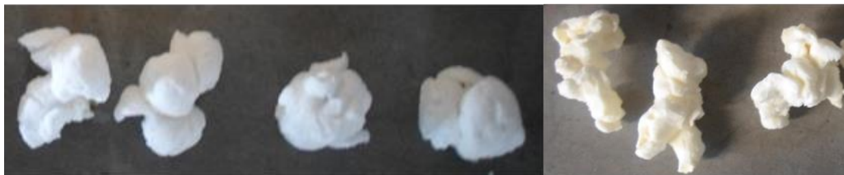
Figure 4. Rosette shape obtained in the busted tests. a) rosettes of experimental hybrid corn and b) rosettes of commercial corn of the North American Yellow Pearl race.

Regarding the type of rosette, the commercial genotype showed a popcorn shape that approximates the ‘butterfly’ type, while the hybrid presented a form that approximates the type ‘fungus’ as shown in Figure 4. And in the variable pericarp sprayed, the commercial genotype exhibited a pericarp that fragmented, while the hybrid presented a pericarp whole and stuck to the popcorn.