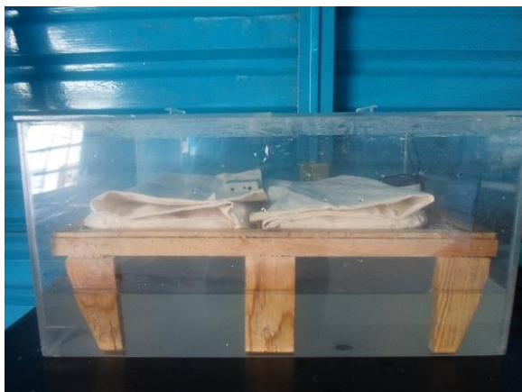
Figure 2. Airtight structure to generate the modified atmospheres and obtain different equilibrium humidities in the popcorn grain.

The moisture content of the grain was determined under the different atmospheres modified using the oven drying method at 103 °C, for 17 h according to the protocols described by the ISTA (1996) in four repetitions per treatment.