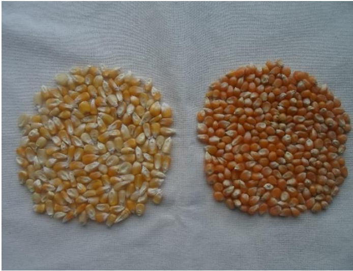
Figure 1. On the left, the genotype NAYPP-II × MEX5-77, on the right commercial popcorn maize of the North American Yellow Pearl race.