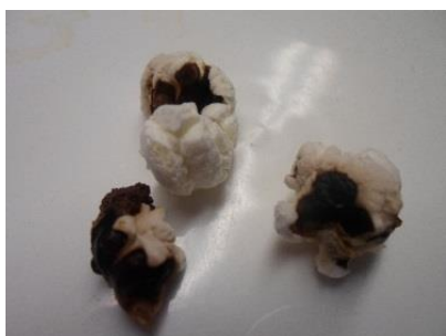
Figure 5. Popcorn produced at a time of exposure to microwaves at 3:00 min.

In this study, it is important to point out that when the time of 3:00 min was used in the microwave, there were burns in the popcorn, such as those observed in Figure 5. Therefore, it is not advisable to use this time exposition.