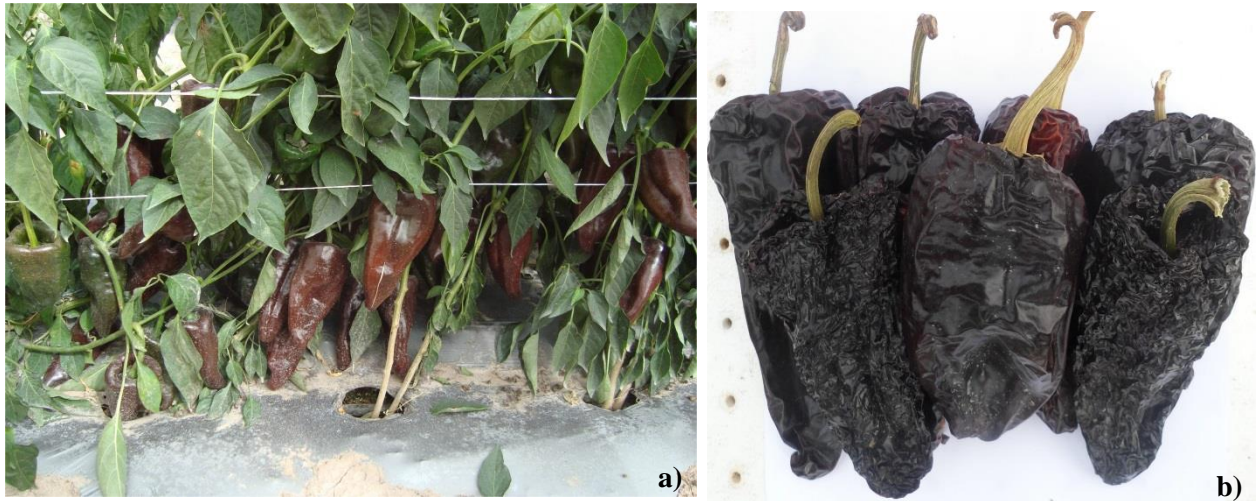
Figura 2. Mulatto wide chili hybrid HAM14F. a) plant with fruits in mature state; b) dehydrated fruits.