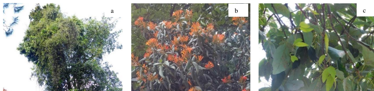
Figure 2. Trees infested by mistletoe located in places of the avocado producing region of Uruapan, Michoacan 2017. 2a) partial view of a ‘creole’ avocado tree with severe infestation by mistletoe Psittacanthus calyculatus ; 2b) plants of P. calyculatus in full flowering; 2c) approach to the foliar area of a ‘Fuerte’ avocado plant infested by mistletoe Struthanthus venetus .

Special care was taken to avoid the supply of nutrition inputs or pesticides that could interfere with the hemiparasitic. For the registered data, an analysis of variance (Anova) was performed using the proc Anova procedure of the statistical package system for Windows version 9.2 (SAS, 2013). The multiple comparison of the means was carried out by the Tukey test ( p \geq 0.05 ), to order the impact of infestation and development of the hemiparasitic plants under treatment.