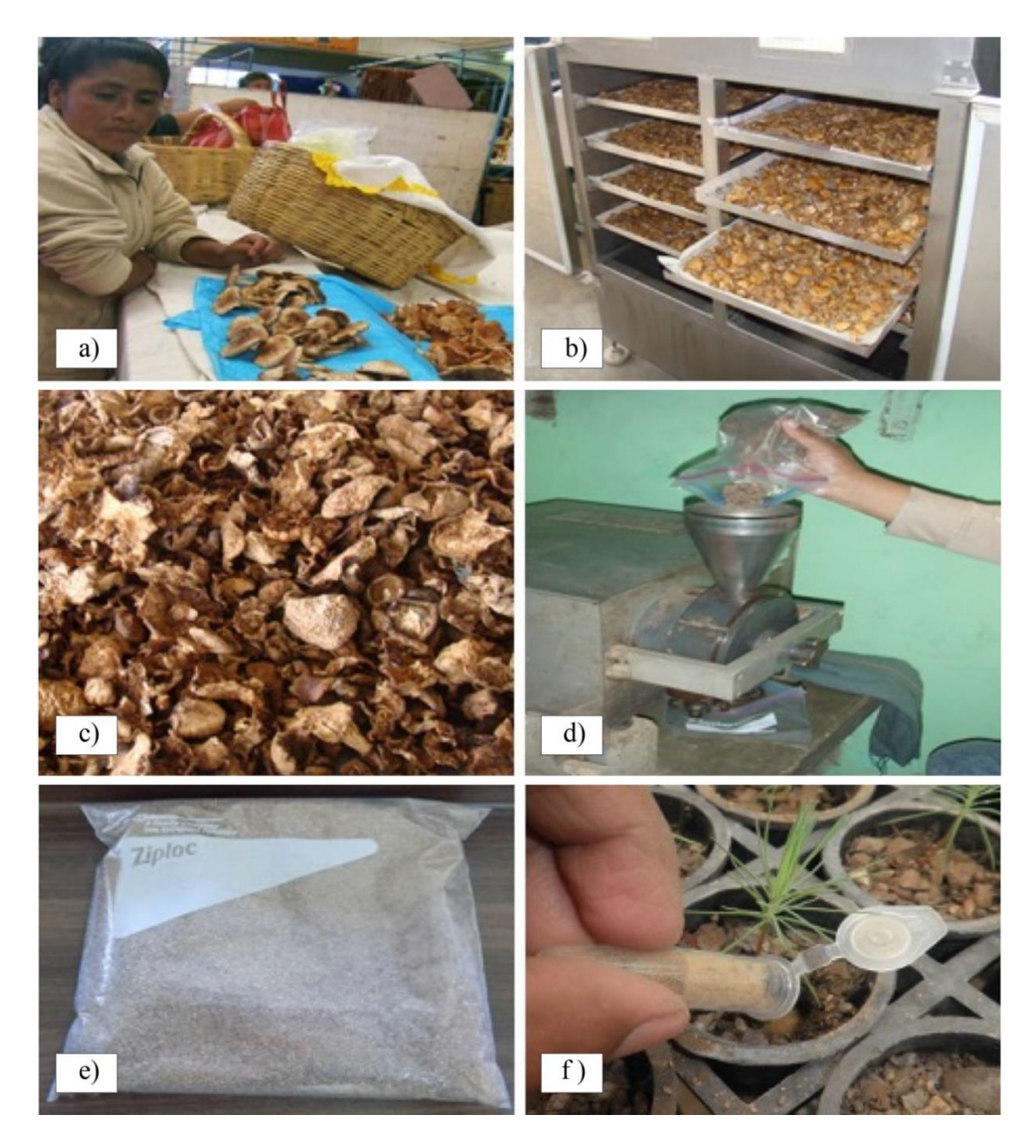
Figure 1. a) Lady collecting edible wild mushrooms in the market of Ozumba, State of Mexico; b) fresh mushrooms of Hebeloma spp. in the dehydrator; c) fungi of the genus Hebeloma spp. dehydrated; d) mill used for mushroom dehydration; e) Dehydrated inoculant of Hebeloma spp.; f) inoculation of Pinus greggii with Hebeloma sp.

Preparation of ectomycorrhizal inoculants based on powder spores. Species sporomes of the edible ectomycorrhizal fungi belonging to the genera Hebeloma and Laccaria (Figure 1a and 2a), were acquired in the market of Ozumba, State of Mexico located at 19° 02' 11" north latitude and 98° 47' 48" west longitude, during the months of august and september of 2016. Once the sporomas were acquired, they were classified by species, according to the diagnostic characteristics specified by Carrasco-Hernández et al. (2010, 2015).